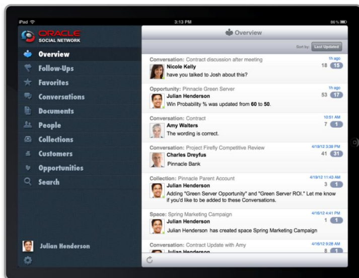
Figure 2: Oracle Social Network Mobile Application

Oracle Social Network can be accessed anywhere and anytime from a variety of interaction points including a Web browser, Outlook application, or Mobile and Tablet devices. Each client provides a rich experience through form factors specific to the devices they run on. Outlook integration bridges the social experience between Oracle Social Network participants and their email. Meanwhile, the native client on the Mobile devices provides a seamless interaction while on the road or as an alternative to the Web client.